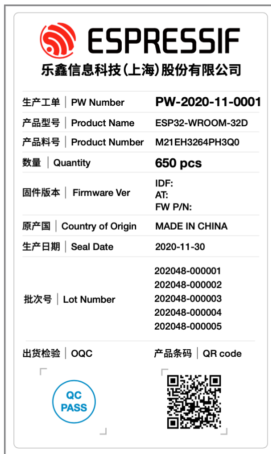
Figure 3: Module Product Label